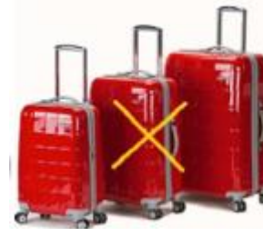
HARD SIDED BAGS NOT PERMITTED