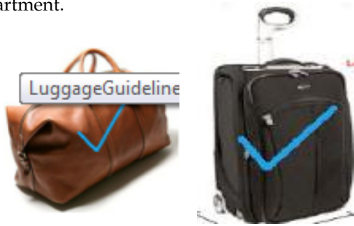
SOFT SIDED BAGS PERMITTED