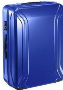
NO HARD BODY CASES