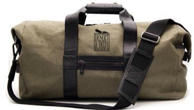
SOFT SIDED BAGS ONLY