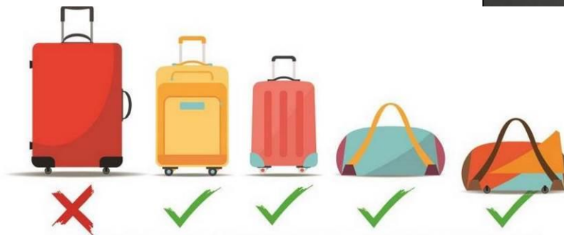
HARD-SIDED BAGS NOT PERMITTED