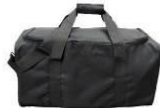
SOFT SIDED BAGS WITH WHEELS THAT ARE NOT IN HARD FRAME