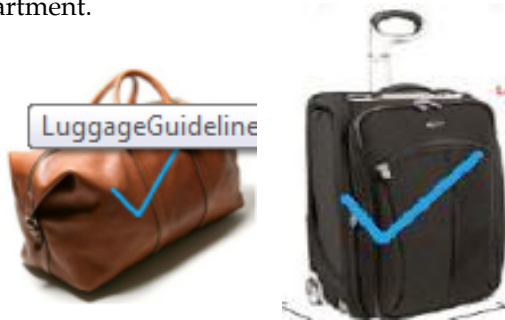
SOFT SIDED BAGS PERMITTED